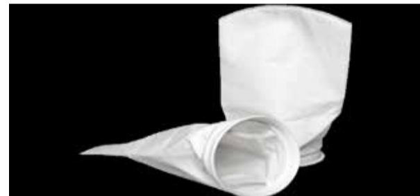
Bag filters for liquids with low and high viscosity

The ultra.care® total filtration management offers users of different filtration types an unique opportunity to consolidate individual suppliers to one single source: Ultrafilter .