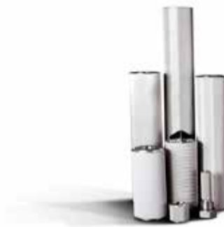
Technical gas and steam filters