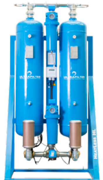
The Ultrafilter GmbH HL adsorption dryer

in proving to Mercedes Benz that the quality and performance of the purification system, manufactured in Hilden, Germany, was the best choice in comparison to other brand. One of the most critical areas of application for compressed air in a car manufacturing plant is paint spraying . The Ultrafilter GmbH adsorption dryers and high performance filters were installed to guarantee the quality of this application.