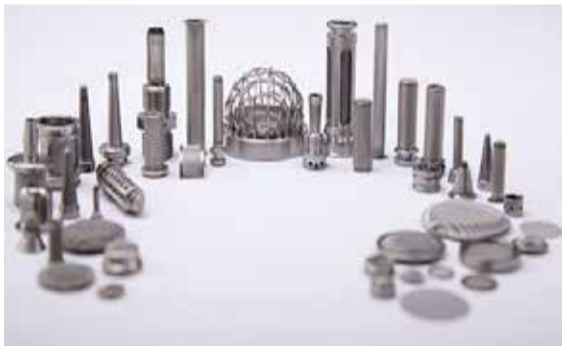
Metal filters and strainers for liquids and plastics