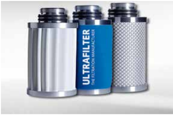
Compressed air filter elements and replacement upgrades for all brands

Ultrafilter is your competent partner for filtration solutions and services from one source