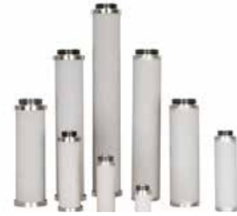
Sterile compressed air filter elements and replacement upgrades for all brands