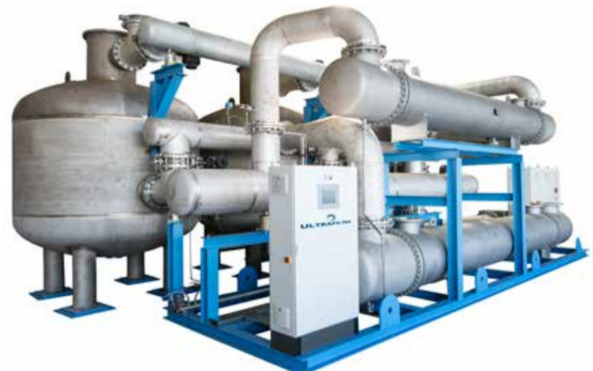
COMPHEAT 3 ® Heat of Compression Adsorption Dryer with a 90.000 m 3 /h compressed air capacity.

Therefore today Ultrafilter GmbH represents a manufacturer with a high degree of flexibility and knowledge to produce products with high complexity specific to customer requirements. An example of this competence is the stainless steel heat of compression adsorption dryer manufactured for TsAgi or high efficiency filters made of copper for an application in the gas industry.