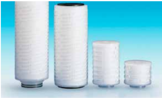
Liquid filters and membranes from 50µ to 0.1µ